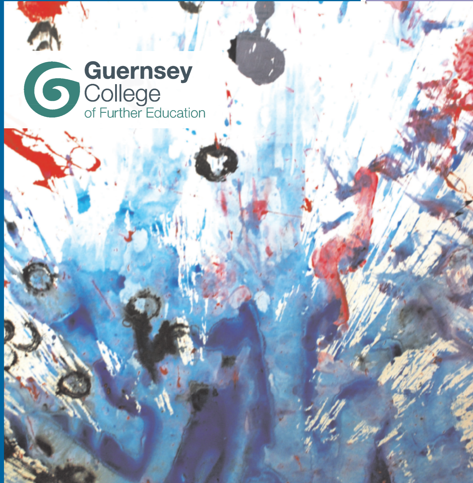
BTEC National Diploma Art & Design group project

Guernsey College of Further Education Route de Coutanchez, St Peter Port, Guernsey GY1 2TT. Tel: 01481 737500